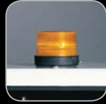
Safety Strobe Light