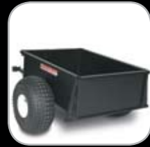
Swisher Dump Cart