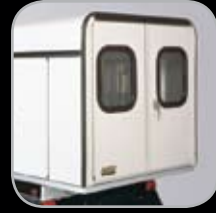
Custom Van Box