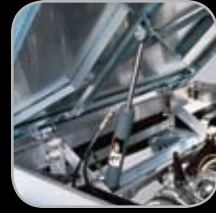
Hydraulic and Electric Bed Lift