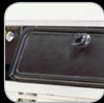
Locking Glove Box