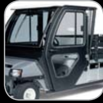
Certified ROPS Cab Enclosure