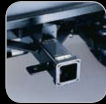
2-Inch Rear Receiver Hitch