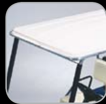
Canopy Top White