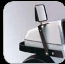
Heavy-Duty Bumper/ West Coast Mirror