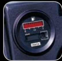
Fuel Gauge and Hour Meter